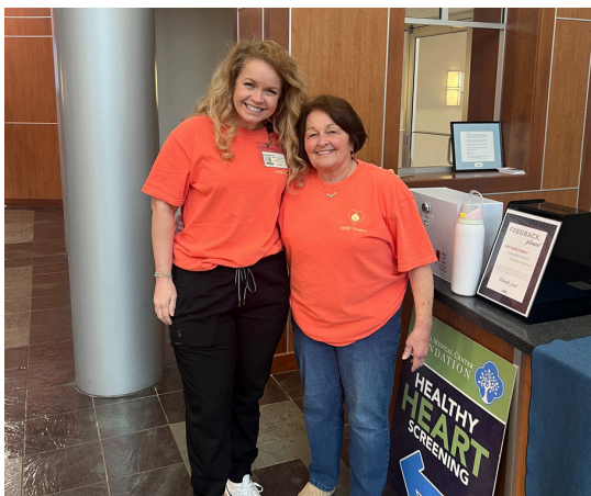
Heart Day Screenings