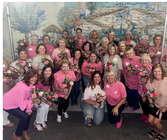
Pink Petal Party