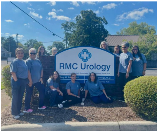
Free Prostate Screenings

Through our connection events throughout the year, we provided free screenings to hundreds of neighbors—catching potential health issues early and connecting people with the care they need.