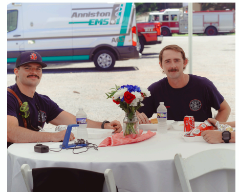
EMS Week Breakfast & Luncheon