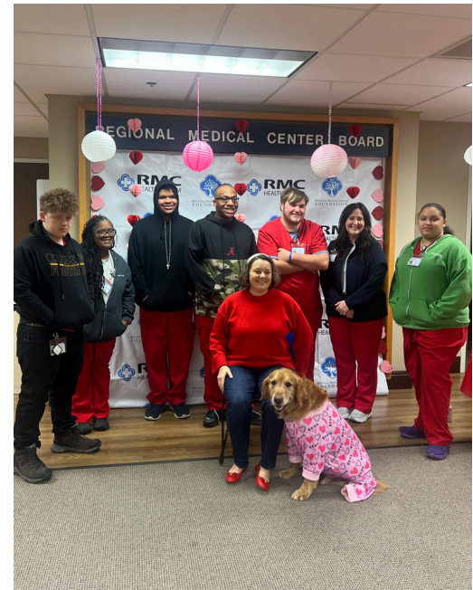
Funded Programs that Brought Joy & Transformed Patient Experiences