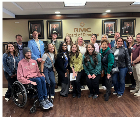
Leadership Calhoun County