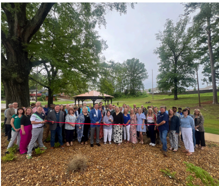
Tyler Park Ribbon Cutting

Healthcare extends beyond hospital walls. From supporting future healthcare professionals through our scholarship to and developing relationships with local businesses and industries, we're building a healthier, stronger community for generations to come.