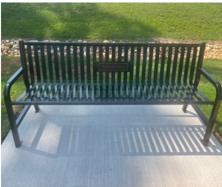
Memorial Bench Donations