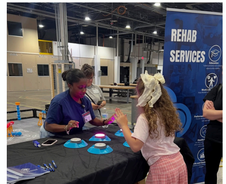
SparkSTEM Discovery Day