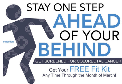
Free at Home Colorectal Kits