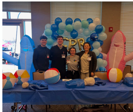
Worlds of Work