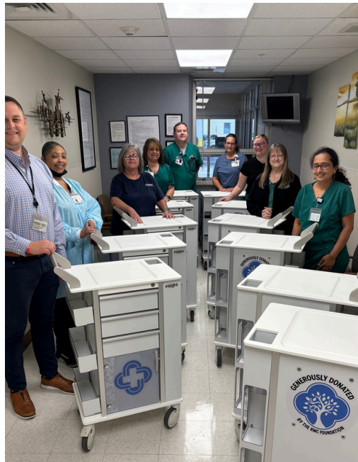
Provided Equipment for our Staff